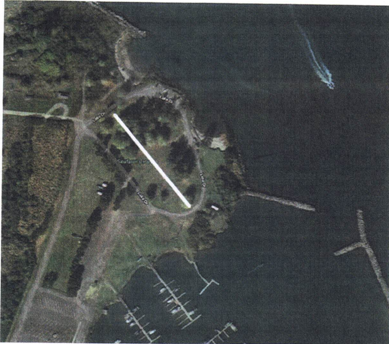
Photo shows proposed camping area south of the white line