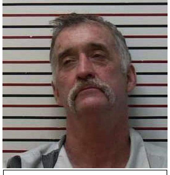
Crawford 2/25/21 Booking Photo