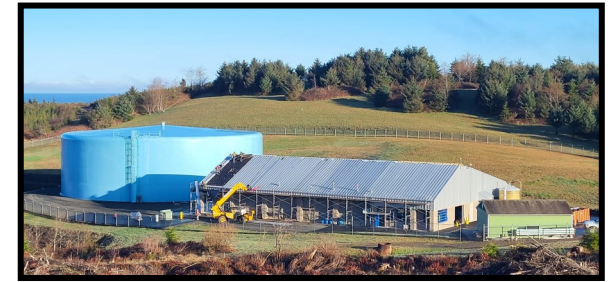
New roof install at Water Treatment Plant

"Making a difference through excellence of service"