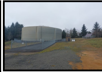
Commercial divers cleaning and inspecting drinking water tanks.